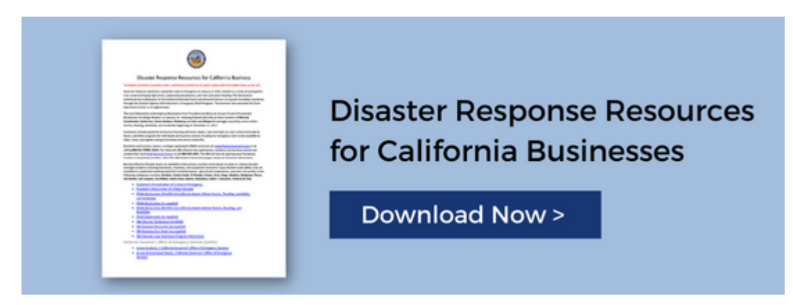
To download the CalOSBA Disaster Resources for California Businesses guide, click here.

Governor Newsom declared a statewide state of emergency on January 4, 2023, related to a series of atmospheric river systems bringing high winds, substantial precipitation, and river and urban flooding. The Declaration