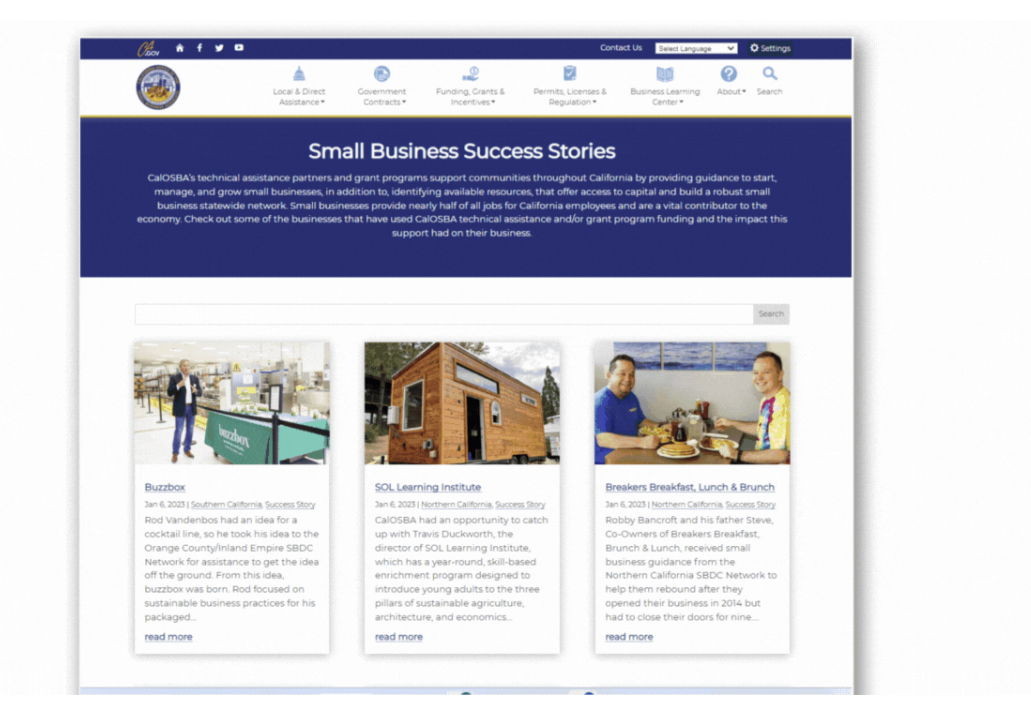
An animated image showing different businesses on the small business success stories webpage at CalOSBA.ca.gov.